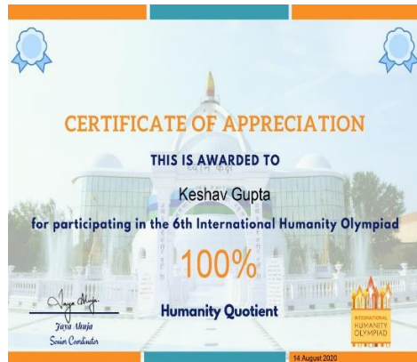
Students who have achieved success in International Competitions.

The school Library will continue to conduct Online Literary Activities to provide all students the opportunity to participate and achieve success in various competitions. School also encourages students participate in Online National/International Competitions conducted during this pandemic.